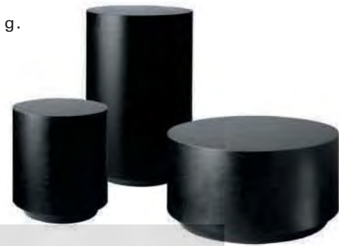
g. display cylinders* Black