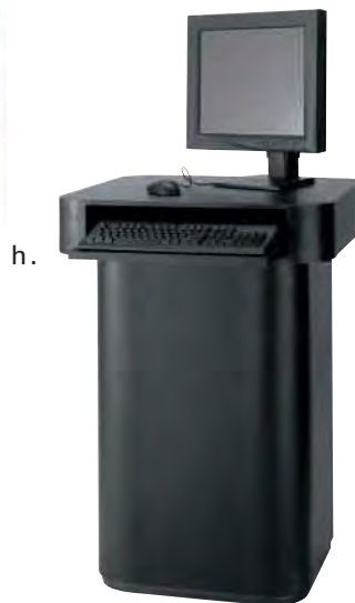
h. orion computer kiosk 28"W 28"L 40.5"H – N75079 (Computer not included.)