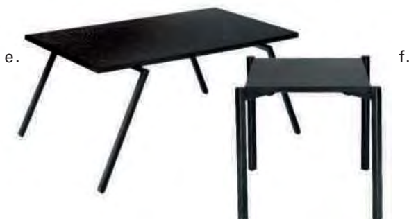
e. studio cocktail table 36"W 20"L 15"H – C115103